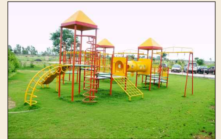
Kids Play Station