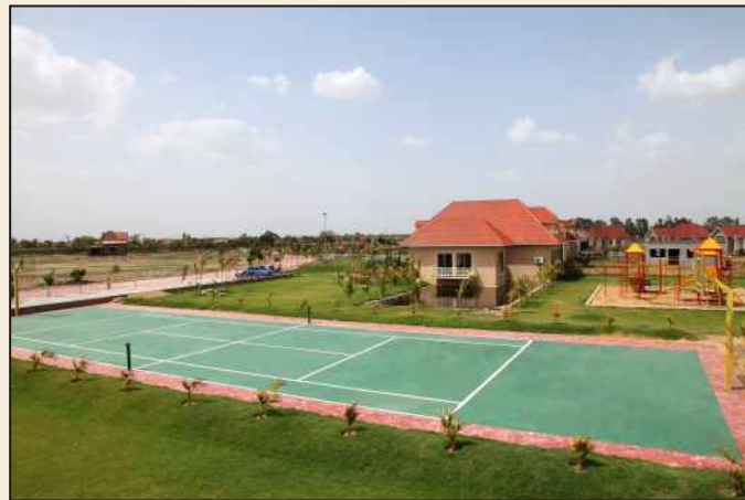
Lawn Tennis & Basket Ball