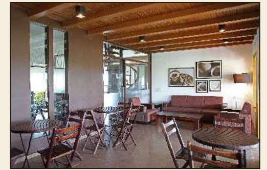
Café - Cupid