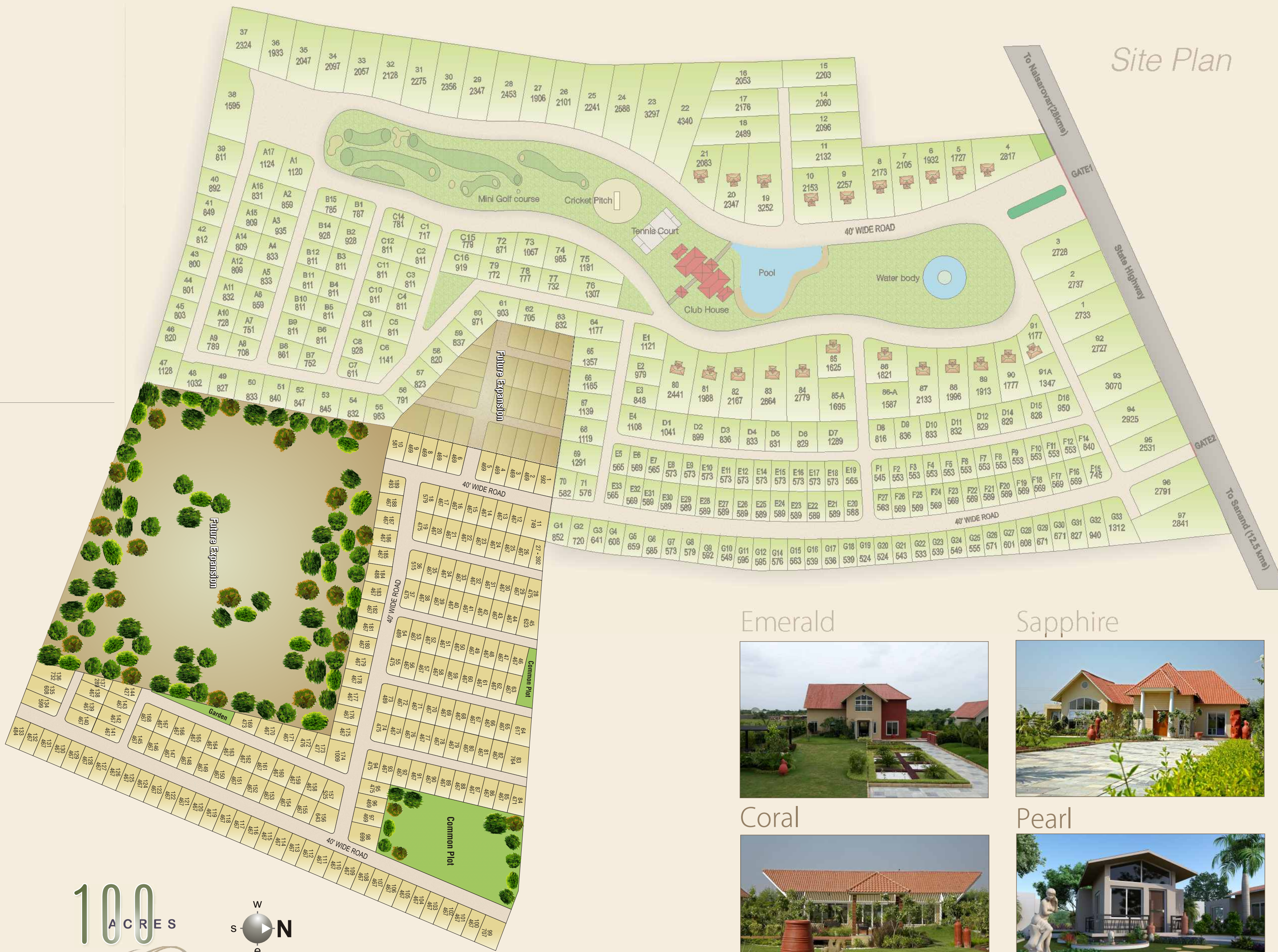
Life in the lap of nature