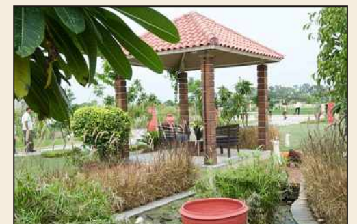
Lilly pond with Gazebo