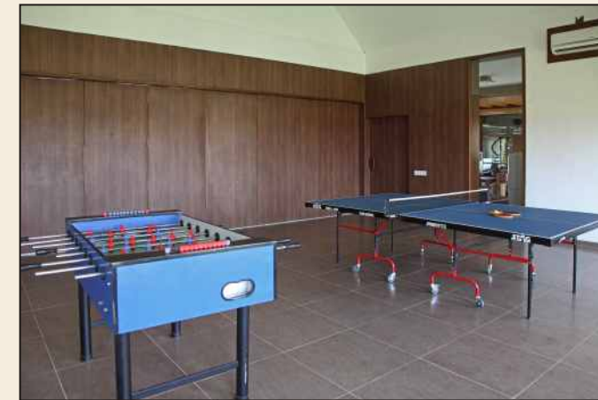
Table Tennis & Hand Soccer